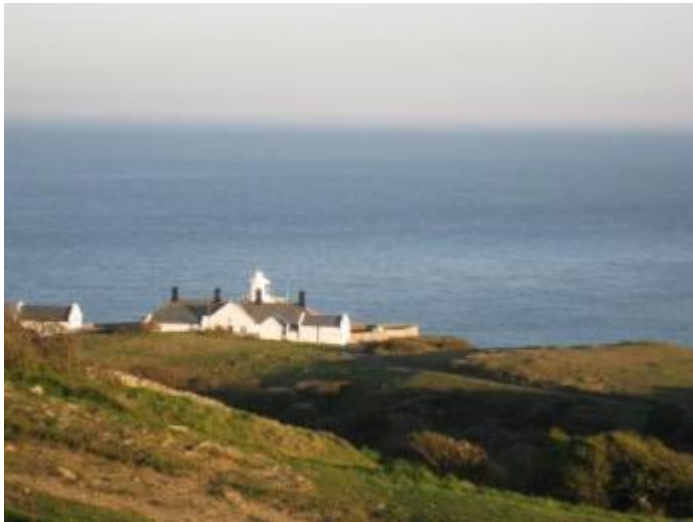
Anvil Point Lighthouse