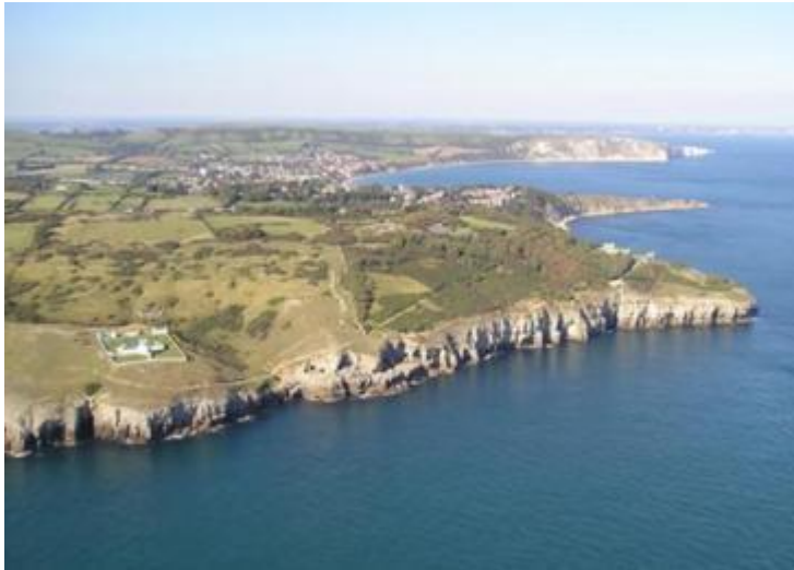
Aerial Photograph of Durlston