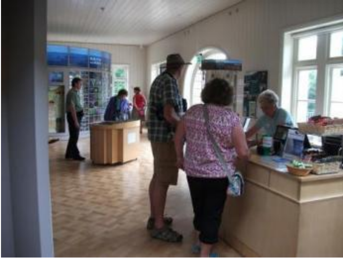
Durlston Main Reception